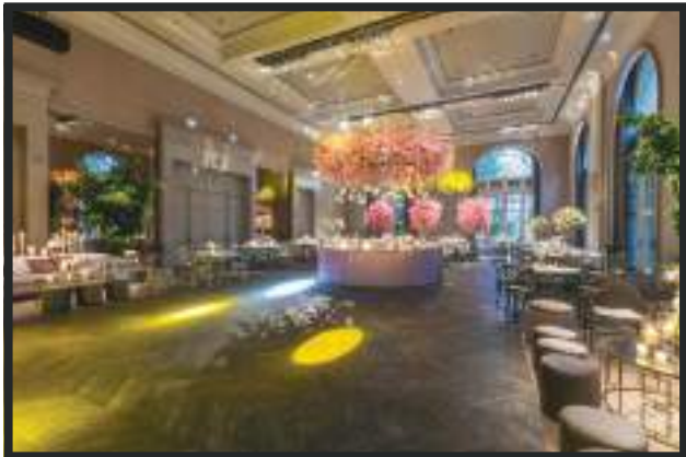
Goa's Greatest Clubhouse

INTERNATIONAL 5-STAR LIFESTYLE GATED DEVELOPMENT SPREAD OVER 130 ACRES.