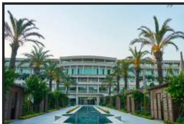
Goa's Finest 5-star Hotel