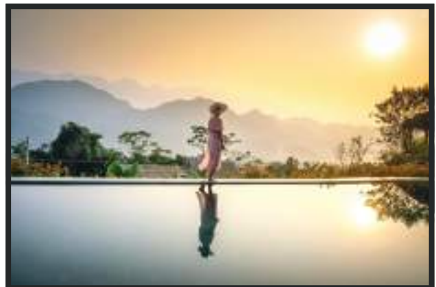
Goa's Greatest Tranquility Avenues