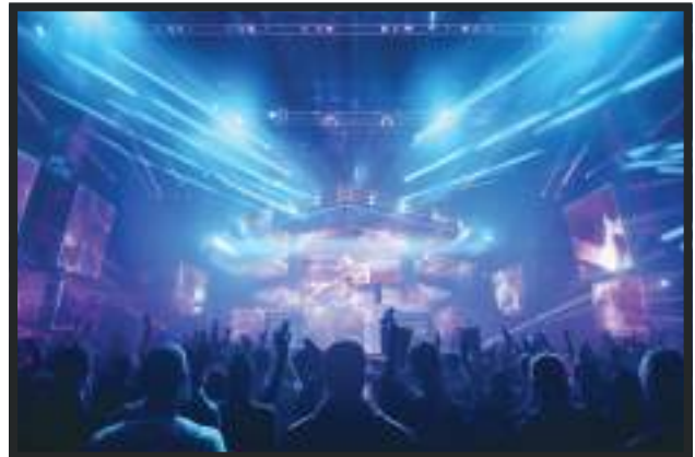
Goa's Greatest Party Hotspots