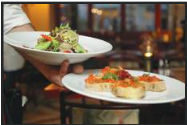
Goa's Greatest Fine Dining Hotspots